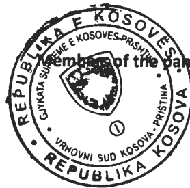
Emine Mustafa Supreme Court Judge